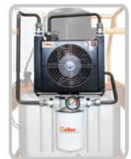
• Air-Cooled Heat Exchanger + Spin-On Return Filter